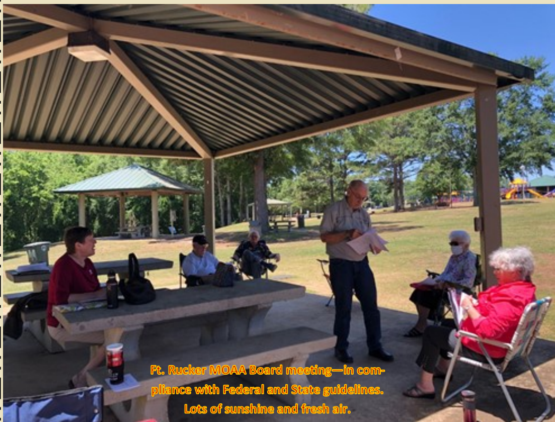
Ft. Rucker MOAA Board meeting—In compliance with Federal and State guidelines. Lots of sunshine and fresh air.